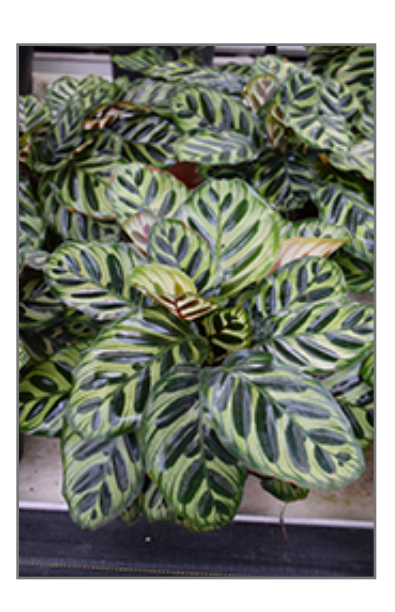
Peacock Plant in full

There are many factors that will affect the ultimate height, spread and overall performance of a plant when grown indoors; among them, the size of the pot it's growing in, the amount of light it receives, watering frequency, the pruning regimen and repotting schedule. Use the information described here as a guideline only; individual performance can and will vary. Please contact the store to speak with one of our experts if you are interested in further details concerning recommendations on pot size, watering, pruning, repotting, etc.