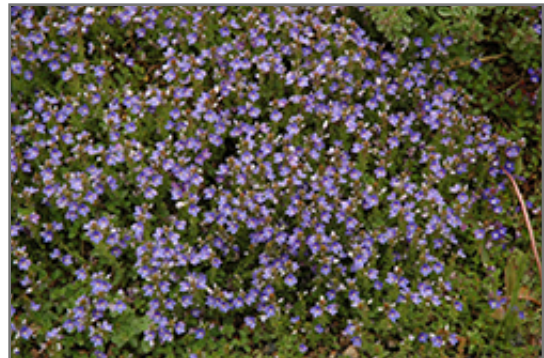
Turkish Speedwell in bloom

Turkish Speedwell is recommended for the following landscape applications;