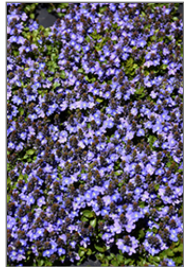
Turkish Speedwell flowers

Turkish Speedwell is recommended for the following landscape applications;