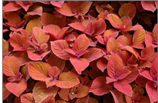
Campfire Coleus foliage