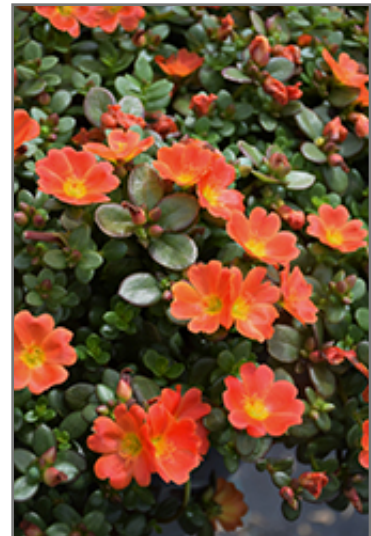
Mojave Tangerine Portulaca flowers

Mojave Tangerine Portulaca is recommended for the following landscape applications;