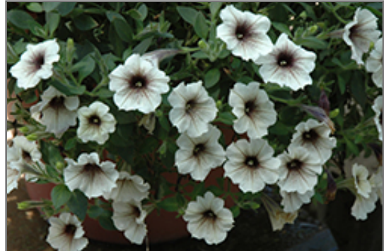
Supertunia Latte Petunia flowers