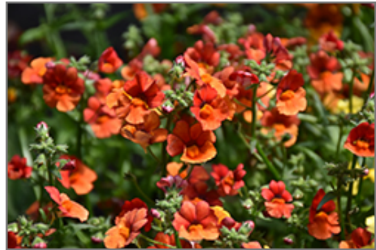
Sunsatia Blood Orange Nemesia flowers