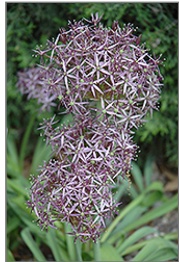
Star Of Persia Onion flowers