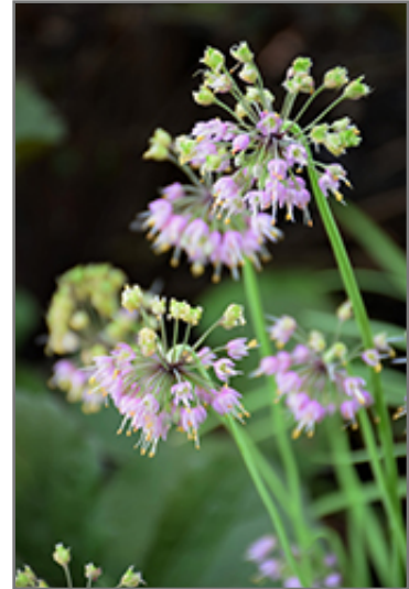
Nodding Onion flowers

This plant should only be grown in full sunlight. It does best in average to evenly moist conditions, but will not tolerate standing water. It is not particular as to soil type or pH, and is able to handle environmental salt. It is highly tolerant of urban pollution and will even thrive in inner city environments. This species is native to parts of North America. It can be propagated by multiplication of the underground bulbs.