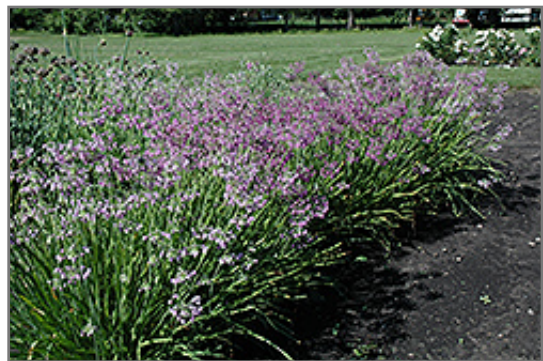
Nodding Onion in bloom