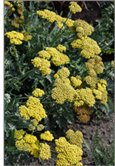
Moonshine Yarrow flowers

Moonshine Yarrow will grow to be about 24 inches tall at maturity, with a spread of 24 inches. It grows at a fast rate, and under ideal conditions can be expected to live for approximately 10 years. As an herbaceous perennial, this plant will usually die back to the crown each winter, and will regrow from the base each spring. Be careful not to disturb the crown in late winter when it may not be readily seen!