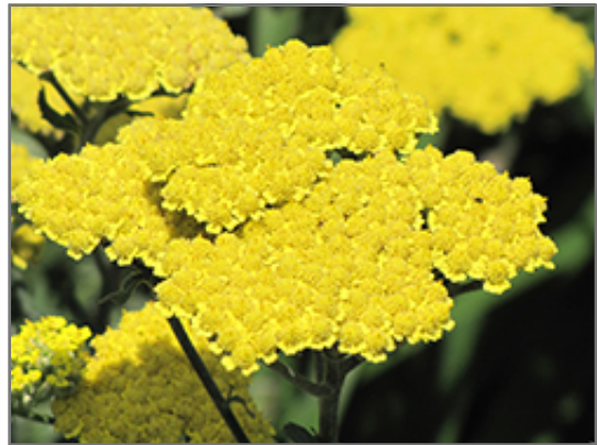
Moonshine Yarrow flowers