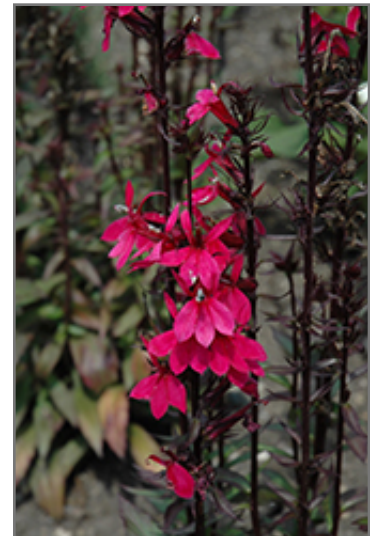
Starship Deep Rose Lobelia flowers

Starship Deep Rose Lobelia is recommended for the following landscape applications;