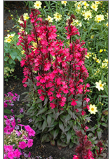
Starship Deep Rose Lobelia in bloom