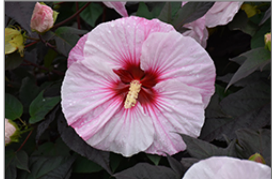
Summerific Perfect Storm Hibiscus flowers

Summerific Perfect Storm Hibiscus is recommended for the following landscape applications;