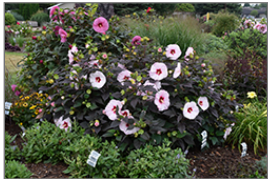
Summerific Perfect Storm Hibiscus in bloom