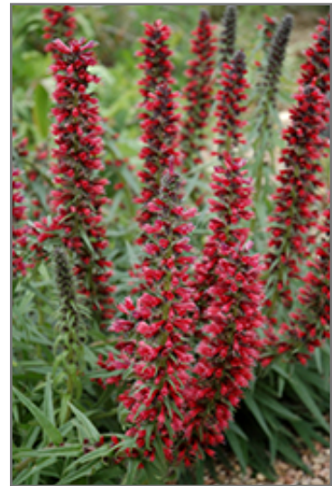
Red Feathers flowers