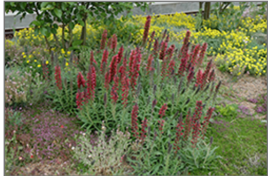
Red Feathers in bloom