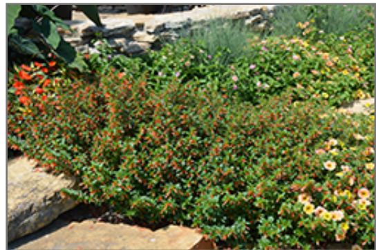
Vermillionaire Large Firecracker Plant in bloom