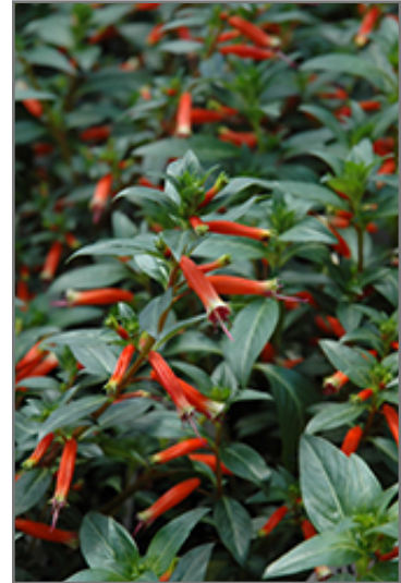
Vermillionaire Large Firecracker Plant flowers

Vermillionaire Large Firecracker Plant is a fine choice for the garden, but it is also a good selection for planting in outdoor pots and containers. With its upright habit of growth, it is best suited for use as a 'thriller' in the 'spiller-thriller-filler' container combination; plant it near the center of the pot, surrounded by smaller plants and those that spill over the edges. It is even sizeable enough that it can be grown alone in a suitable container. Note that when growing plants in outdoor containers and baskets, they may require more frequent waterings than they would in the yard or garden.