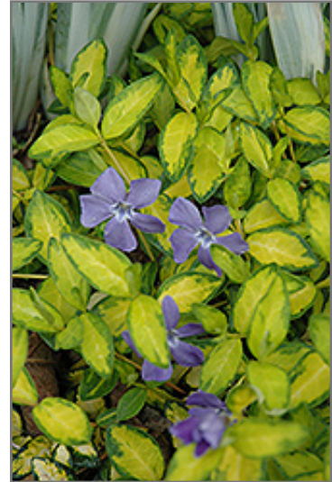
Illumination Periwinkle flowers

Illumination Periwinkle is a fine choice for the garden, but it is also a good selection for planting in outdoor pots and containers. Because of its spreading habit of growth, it is ideally suited for use as a 'spiller' in the 'spiller-thriller-filler' container combination; plant it near the edges where it can spill gracefully over the pot. Note that when growing plants in outdoor containers and baskets, they may require more frequent waterings than they would in the yard or garden.