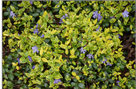
Illumination Periwinkle in bloom