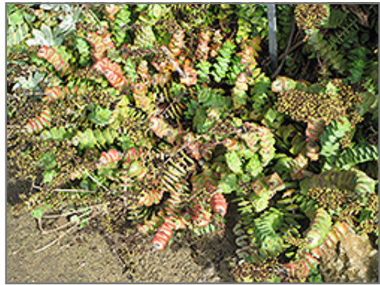
String Of Buttons

String Of Buttons is recommended for the following landscape applications;