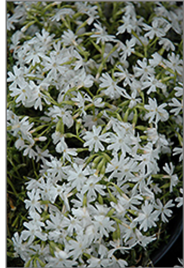
Snowflake Phlox flowers

This variety produces a showy carpet of bright white flowers shining in the spring sun; prune lightly after flowering to encourage a dense growth habit; wonderful for rock gardens, edging, or in mixed containers