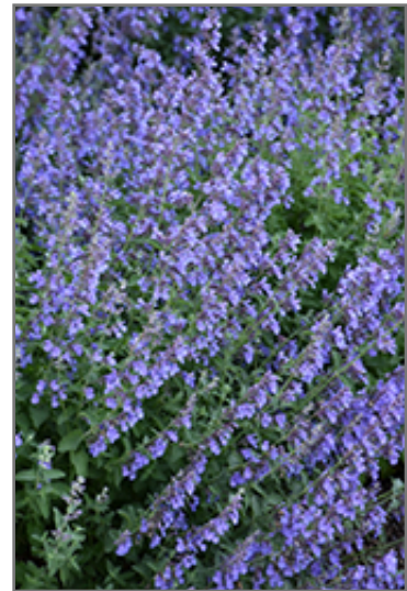
Cat's Meow Catmint flowers

Cat's Meow Catmint is recommended for the following landscape applications;