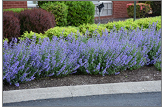
Cat's Meow Catmint in bloom

Cat's Meow Catmint will grow to be about 16 inches tall at maturity, with a spread of 30 inches. Its foliage tends to remain dense right to the ground, not requiring facer plants in front. It grows at a fast rate, and under ideal conditions can be expected to live for approximately 10 years. As an herbaceous perennial, this plant will usually die back to the crown each winter, and will regrow from the base each spring. Be careful not to disturb the crown in late winter when it may not be readily seen!