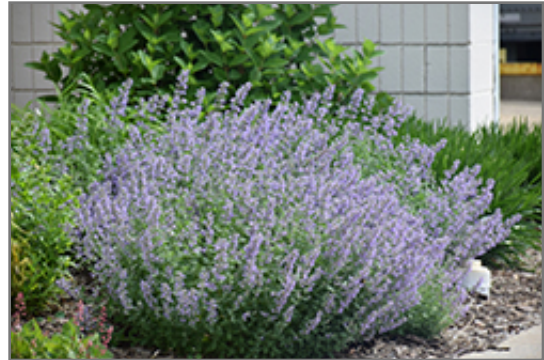
Cat's Meow Catmint in bloom