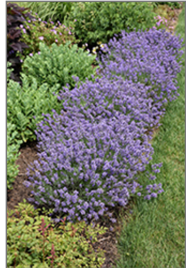
Essence Purple Lavender in bloom