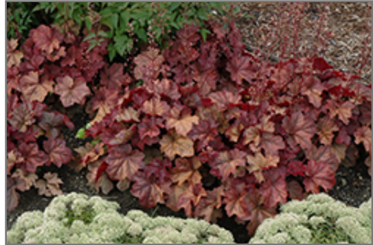
Lava Lamp Coral Bells

Lava Lamp Coral Bells will grow to be about 16 inches tall at maturity extending to 32 inches tall with the flowers, with a spread of 28 inches. When grown in masses or used as a bedding plant, individual plants should be spaced approximately 24 inches apart. Its foliage tends to remain dense right to the ground, not requiring facer plants in front. It grows at a medium rate, and under ideal conditions can be expected to live for approximately 10 years. As an evergreen perennial, this plant will typically keep its form and foliage year-round.