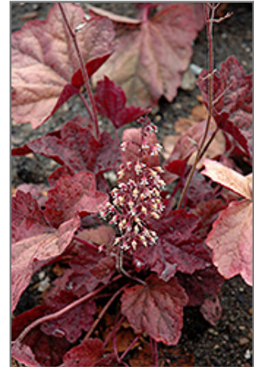
Lava Lamp Coral Bells flowers