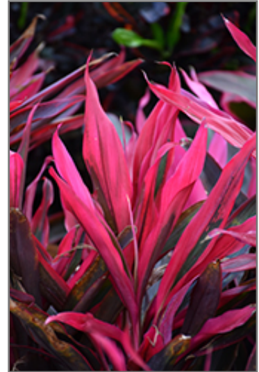
Maria Cordyline foliage