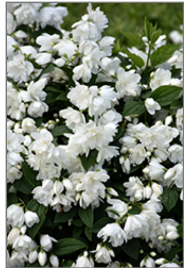
Snowbelle Mockorange flowers