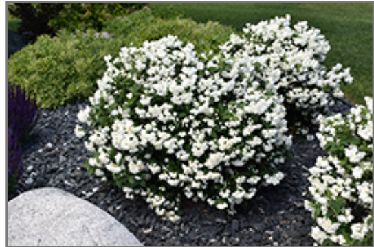
Snowbelle Mockorange in bloom