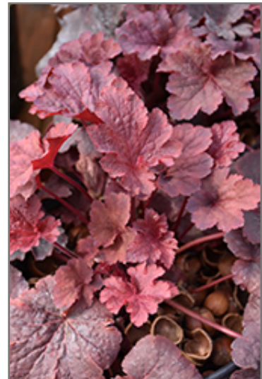
Cajun Fire Coral Bells foliage

Cajun Fire Coral Bells is recommended for the following landscape applications;