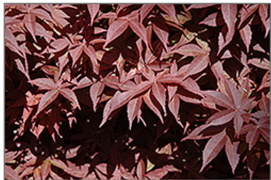
Rhode Island Red Japanese Maple foliage