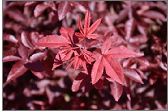
Rhode Island Red Japanese Maple foliage

Rhode Island Red Japanese Maple will grow to be about 12 feet tall at maturity, with a spread of 12 feet. It has a low canopy with a typical clearance of 3 feet from the ground, and is suitable for planting under power lines. It grows at a slow rate, and under ideal conditions can be expected to live for 80 years or more.