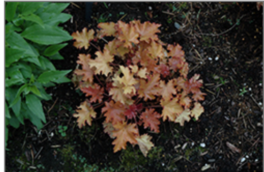
Zipper Coral Bells