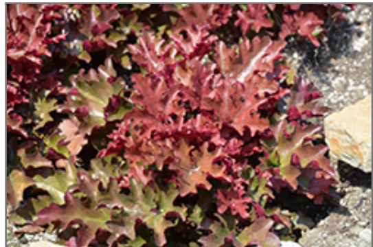
Dolce Cinnamon Curls Coral Bells foliage

Dolce Cinnamon Curls Coral Bells is recommended for the following landscape applications;