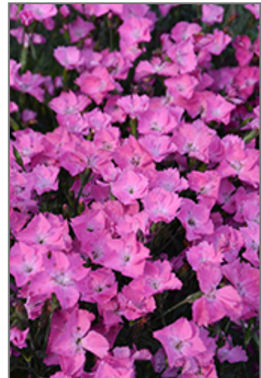
Beauties Kahori Pink Pinks flowers

Beauties Kahori Pink Pinks is recommended for the following landscape applications;