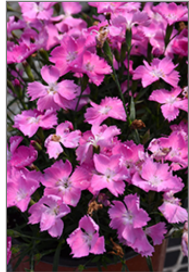
Beauties Kahori Pink Pinks flowers