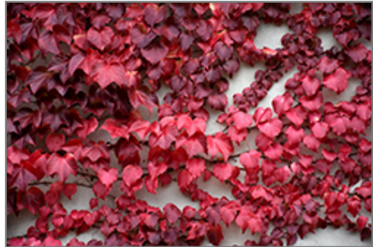
Veitch Boston Ivy in fall