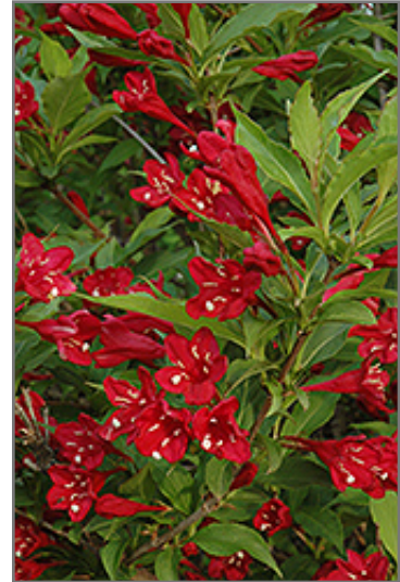
Red Prince Weigela flowers