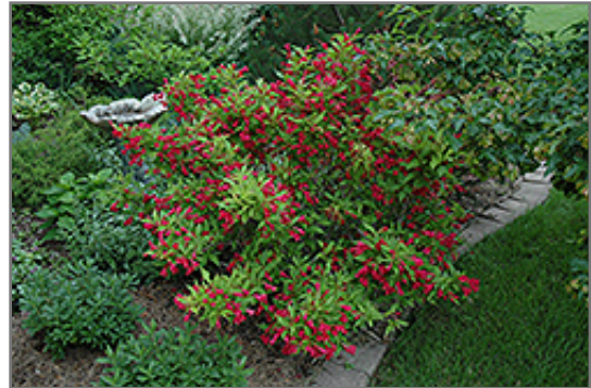
Red Prince Weigela in bloom