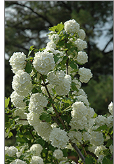
Snowball Viburnum flowers