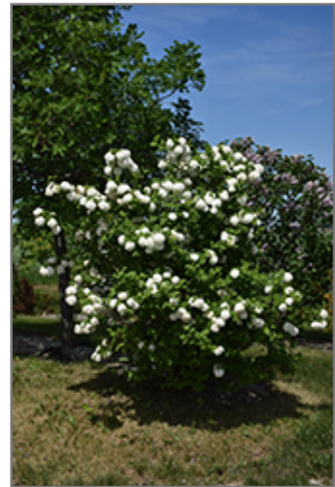
Snowball Viburnum in bloom