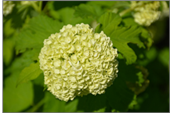
Snowball Viburnum flowers

Snowball Viburnum will grow to be about 12 feet tall at maturity, with a spread of 10 feet. It tends to be a little leggy, with a typical clearance of 1 foot from the ground, and is suitable for planting under power lines. It grows at a medium rate, and under ideal conditions can be expected to live for 40 years or more.