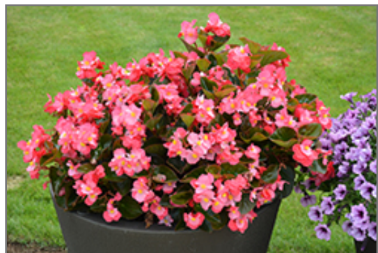
Surefire Rose Begonia in bloom