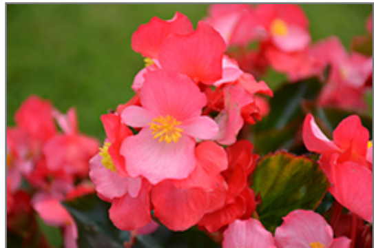
Surefire Rose Begonia flowers

Surefire Rose Begonia is an herbaceous annual with an upright spreading habit of growth. Its medium texture blends into the garden, but can always be balanced by a couple of finer or coarser plants for an effective composition.