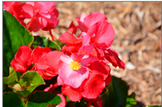
Whopper Rose Green Leaf Begonia flowers

This is a high maintenance plant that will require regular care and upkeep, and usually looks its best without pruning, although it will tolerate pruning. Deer don't particularly care for this plant and will usually leave it alone in favor of tastier treats. Gardeners should be aware of the following characteristic(s) that may warrant special consideration;