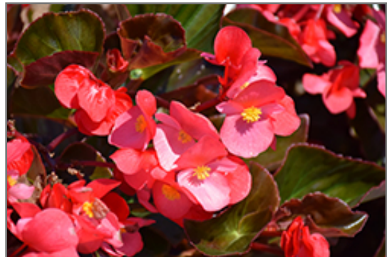
Whopper Rose Bronze Leaf Begonia flowers