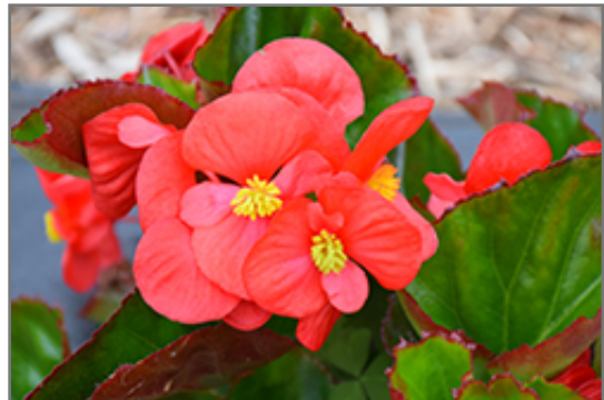
Big Red Green Leaf Begonia flowers