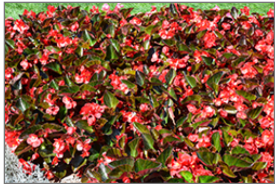
Big Red Bronze Leaf Begonia in bloom

Big Red Bronze Leaf Begonia is a fine choice for the garden, but it is also a good selection for planting in outdoor containers and hanging baskets. It is often used as a 'filler' in the 'spiller-thriller-filler' container combination, providing a mass of flowers and foliage against which the larger thriller plants stand out. Note that when growing plants in outdoor containers and baskets, they may require more frequent waterings than they would in the yard or garden.