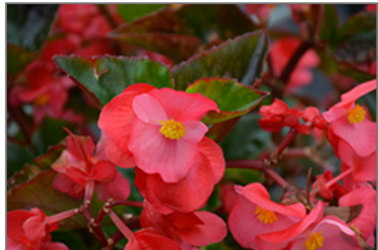
Big Rose Green Leaf Begonia flowers

Big Rose Green Leaf Begonia is recommended for the following landscape applications;