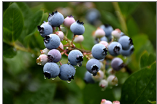
Bluecrop Blueberry fruit

Bluecrop Blueberry features dainty clusters of white bell-shaped flowers with shell pink overtones hanging below the branches in mid spring. It has green deciduous foliage. The glossy oval leaves turn yellow in fall. It features an abundance of magnificent blue berries in mid summer. The smooth brick red bark adds an interesting dimension to the landscape.