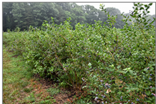
Bluecrop Blueberry fruit