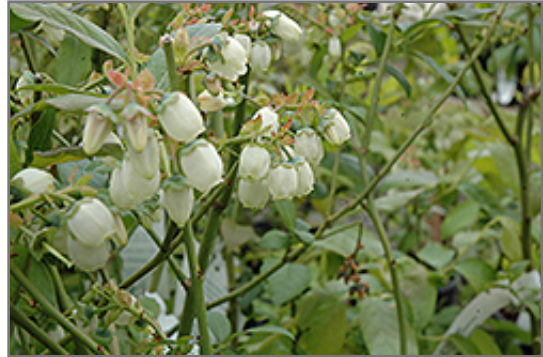
Bluecrop Blueberry flowers

This shrub is typically grown in a designated area of the yard because of its mature size and spread. It does best in full sun to partial shade. It does best in average to evenly moist conditions, but will not tolerate standing water. It is very fussy about its soil conditions and must have sandy, acidic soils to ensure success, and is subject to chlorosis (yellowing) of the foliage in alkaline soils. It is quite intolerant of urban pollution, therefore inner city or urban streetside plantings are best avoided, and will benefit from being planted in a relatively sheltered location. Consider applying a thick mulch around the root zone in winter to protect it in exposed locations or colder microclimates. This is a selection of a native North American species.