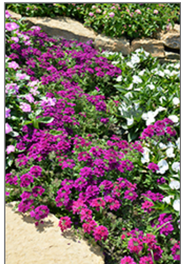
Superbena Royale Plum Wine Verbena in bloom