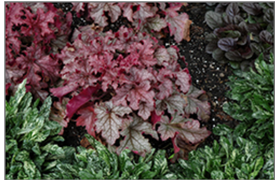
Carnival Peach Parfait Coral Bells