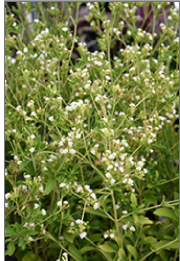
Sweetleaf flowers