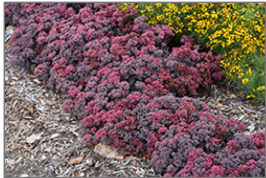
Dazzleberry Stonecrop in bloom