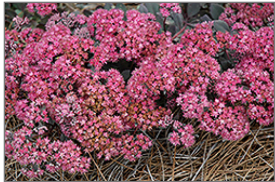
Dazzleberry Stonecrop flowers

Dazzleberry Stonecrop is a dense herbaceous perennial with an upright spreading habit of growth. Its medium texture blends into the garden, but can always be balanced by a couple of finer or coarser plants for an effective composition.