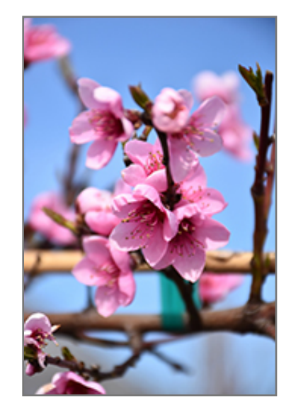
Frost Peach flowers