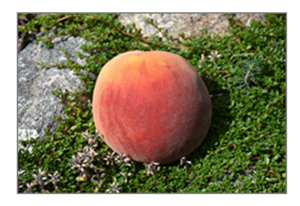
Frost Peach fruit

Frost Peach is smothered in stunning clusters of fragrant hot pink flowers along the branches in early spring, which emerge from distinctive dark red flower buds before the leaves. It has dark green deciduous foliage. The narrow leaves turn yellow in fall. The fruits are showy chartreuse drupes with a scarlet blush, which are carried in abundance in mid summer. The fruit can be messy if allowed to drop on the lawn or walkways, and may require occasional clean-up.