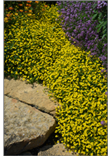
Gold Dust Mecardonia in bloom