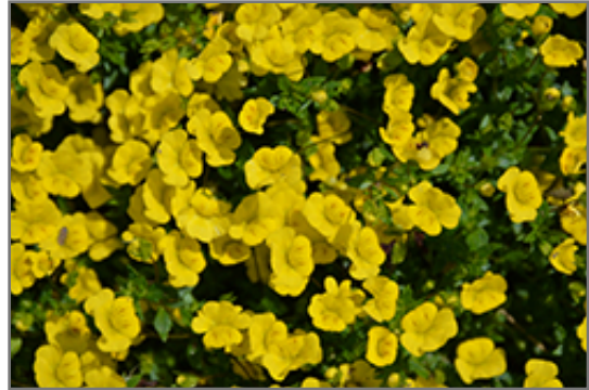
Gold Dust Mecardonia flowers

Gold Dust Mecardonia is a fine choice for the garden, but it is also a good selection for planting in outdoor pots and containers. Because of its spreading habit of growth, it is ideally suited for use as a 'spiller' in the 'spiller-thriller-filler' container combination; plant it near the edges where it can spill gracefully over the pot. Note that when growing plants in outdoor containers and baskets, they may require more frequent waterings than they would in the yard or garden.