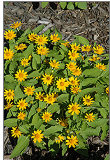
Million Gold Melampodium flowers