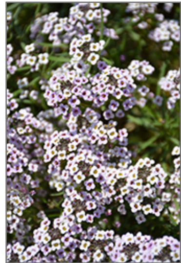
Blushing Princess Sweet Alyssum flowers

Blushing Princess Sweet Alyssum is recommended for the following landscape applications;