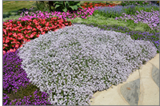
Blushing Princess Sweet Alyssum in bloom

Blushing Princess Sweet Alyssum will grow to be only 6 inches tall at maturity, with a spread of 24 inches. When grown in masses or used as a bedding plant, individual plants should be spaced approximately 20 inches apart. Its foliage tends to remain low and dense right to the ground. This fast-growing annual will normally live for one full growing season, needing replacement the following year.