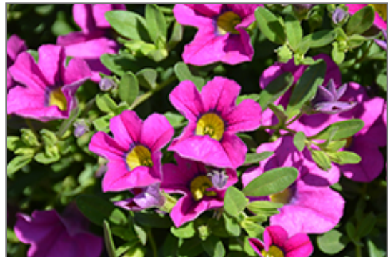
Million Bells Trailing Pink Calibrachoa flowers

Million Bells Trailing Pink Calibrachoa is recommended for the following landscape applications;