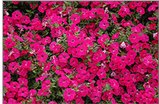
Tidal Wave Hot Pink Petunia in bloom