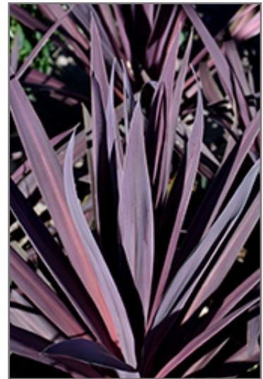
Bauer's Cordyline foliage