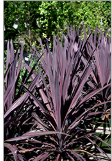
Bauer's Cordyline