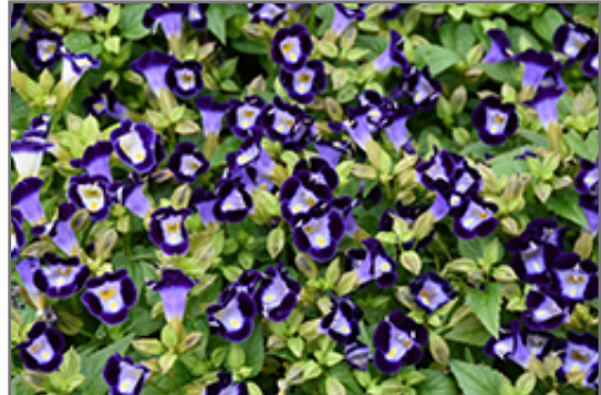
Catalina Midnight Blue Torenia flowers

This plant will require occasional maintenance and upkeep, and should not require much pruning, except when necessary, such as to remove dieback. It is a good choice for attracting bees and hummingbirds to your yard, but is not particularly attractive to deer who tend to leave it alone in favor of tastier treats. It has no significant negative characteristics.