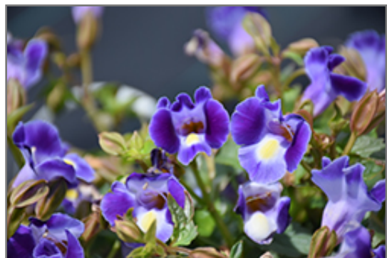
Catalina Midnight Blue Torenia flowers