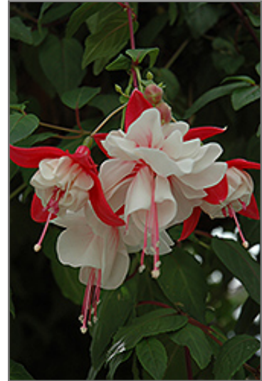
Swingtime Fuchsia flowers