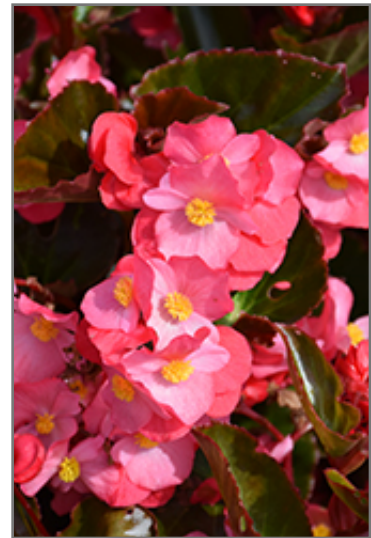
Big Rose Bronze Leaf Begonia flowers

This is a high maintenance plant that will require regular care and upkeep, and usually looks its best without pruning, although it will tolerate pruning. Deer don't particularly care for this plant and will usually leave it alone in favor of tastier treats. Gardeners should be aware of the following characteristic(s) that may warrant special consideration;